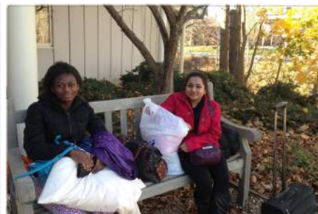
Mount Holyoke College in South Hadley, MA