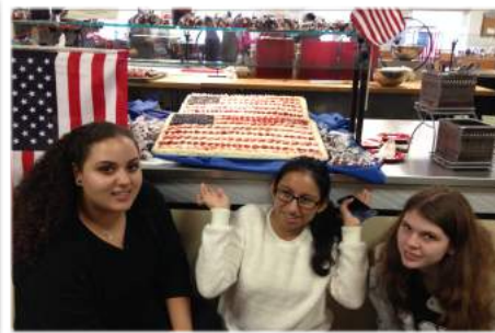
University of Saint Joseph in West Hartford, CT