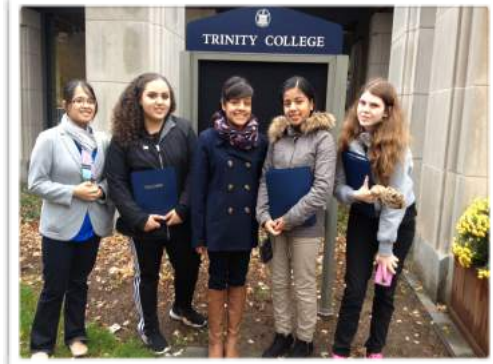
Trinity College in Hartford, CT