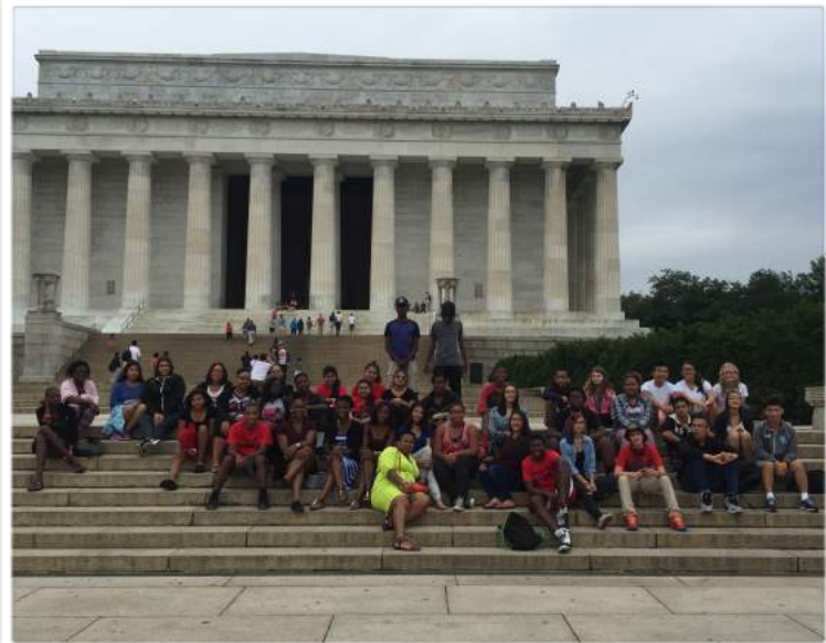
Upward Bound at the Lincoln Memorial in D.C.!

"Show up everyday with a positive attitude and avoid doing the bare minimum because you get out of life what you put in."