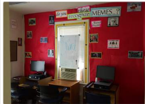
1-on-1 work space & computer lab