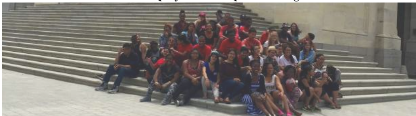
UBMS on the steps of the U.S. Capitol Building in D.C.

First and foremost, I would like to thank Wesleyan University for its unwavering commitment to the Upward Bound program.