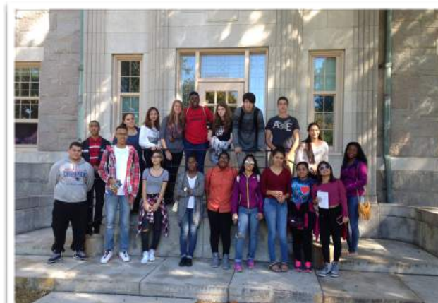
Connecticut College in New London, CT