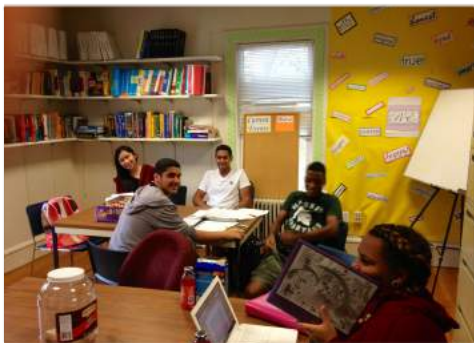
Collaborative work space